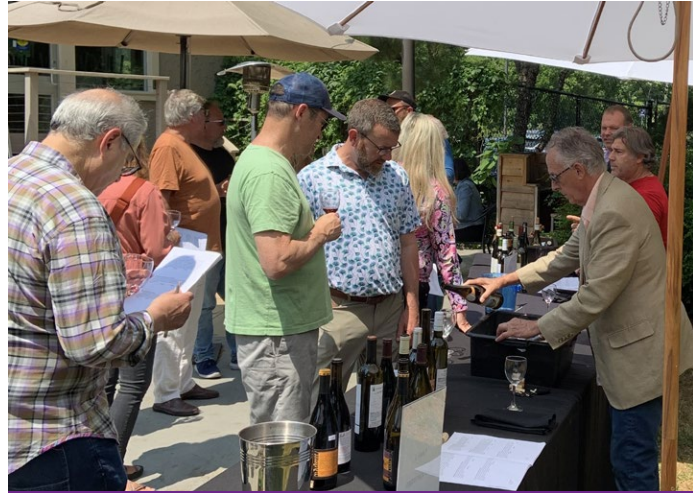
A beautiful afternoon for Top 50.

Some enthusiasts will tell you that Sancerre is the ultimate expression of the Sauvignon Blanc grape. Top 50 attendees said our selections were simply delicious: