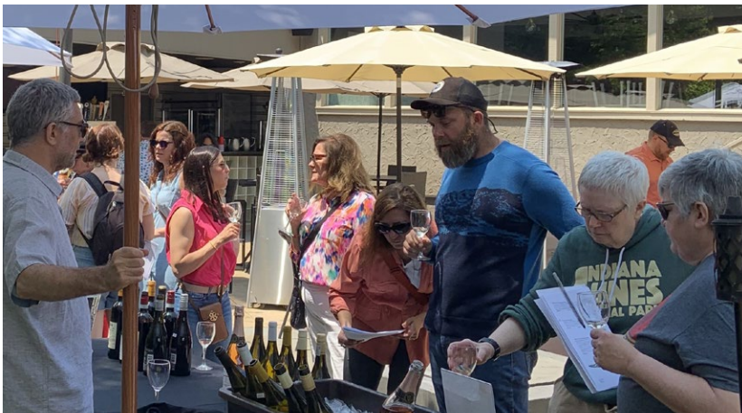
One of our best Top 50s ever!

With a noted winemaker in attendance, a crazy popular wine making a splash, and unprecedented sales, there were three "firsts" for the Top 50 that promise your summer may be made all the more delightful by the wines waiting for you in the shop this season.